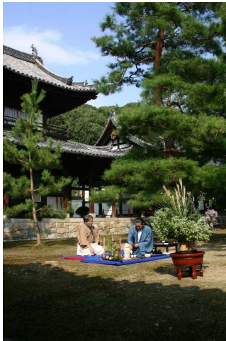
Nodate Picnic at Manpuku-ji Temple in Kyoto Prefecture

Venue: B5 Hall, Tokyo International Forum