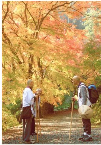
Shikoku Pilgrimage of 88 Temples (Tokushima, Kochi, Ehime, and Kagawa Prefectures) Winning photo entitled Encounter