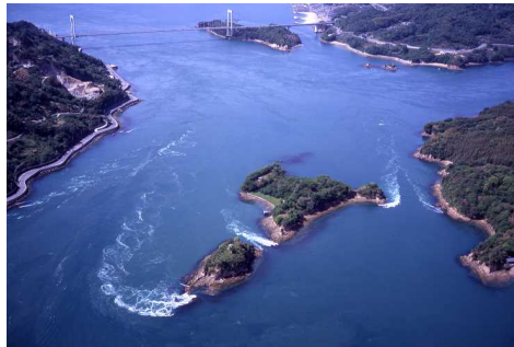
Noshima castle ruins in Ehime Prefecture